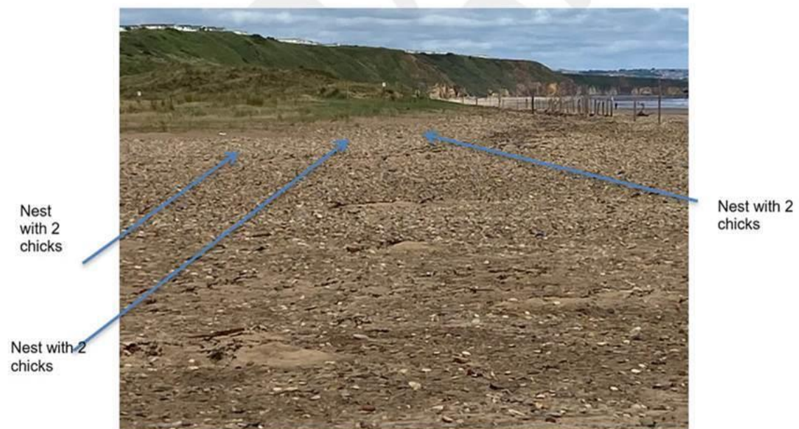
The area to the south of the main colony area where the terns successfully nested.

6.1.32 6.1.36 Given that the known nesting sites for avocets and terns would be subject to a nitrogen dose far lower than 1% of the Critical Load, it is unlikely that atmospheric pollution from the Proposed Development would have significant impacts on the SPA's / Ramsar's breeding bird interest 'alone'. Moreover, in practice the suitability of an area for nesting terns will be less tied to the specific Critical Load (which is only a rough proxy for tern nesting habitat) and precise botanical effects, and more to do with coarse habitat structure i.e. they nest on the beach just above the high tide line, which is very sparsely vegetated (see below screencap from the 2020 Cleveland Little Tern Project Monitoring Report 13 for an image of the nesting location).